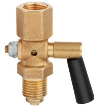
Stopcock Female / male G 1/2 / G 1/2 B, DIN 16261, PN 25